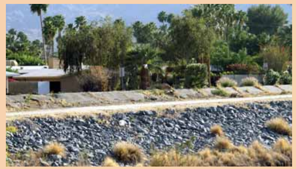
Failing berm and dead oleander

We need the whole community to rally around this effort. Write letters in support of our goals to City Council. Attend the TRENO annual meeting and participate in the Clean Up on November 18, become a member of the Tahquitz Creek Yacht Club. There are all kinds of opportunity for participation. Join in! tcyc@yahoo.com or 774-6525 for more information.