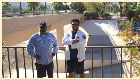
City staff and freshly painted bridge across Tahquitz Creek

Together the three neighborhoods recently formed the Tahquitz Creek Yacht Club, a volunteer organization to lead clean up and fundraising events and to monitor the conditions of the Tahquitz Creek Parkway. A group of dedicated people who will ensure that the Parkway retains its value as a treasured area of the City.