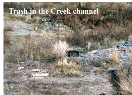
Trash in the Creek channel