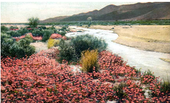
Tahquitz Creek before it became a stormwater channel

After seeing the photograph below, I finally got the picture.